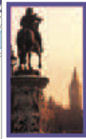
PAGES 68-85 Plans 13, 20-21