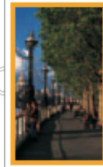
PAGES 184-191 Plans 13-14, 21-22