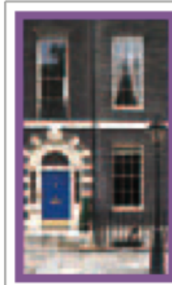
PAGES 120-131 Plans 4-5, 13