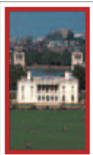
PAGES 236-243 Plans 3-4, 11-12