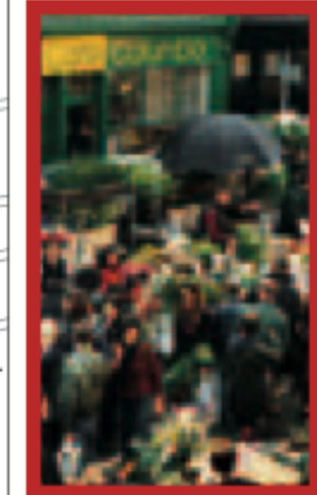
PAGES 160-171 Plans 6-7, 14, 16