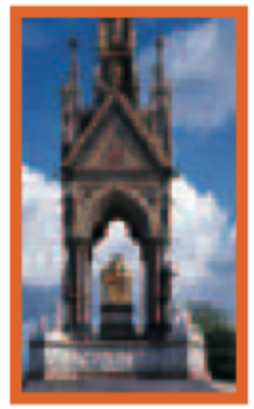
PAGES 198-213 Plans 10-11, 18-19