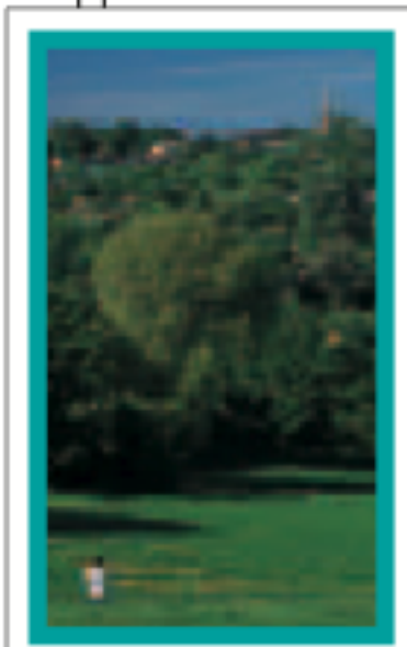
PAGES 228-235 Plans 1-2