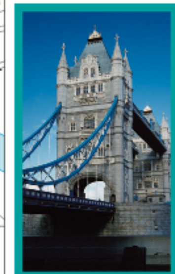
PAGES 142-159 Plans 14-16