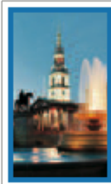
PAGES 98-109 Plans 12-13