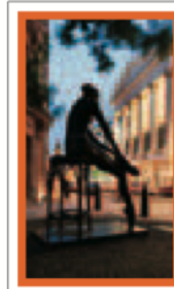
PAGES 110-119 Plans 13-14