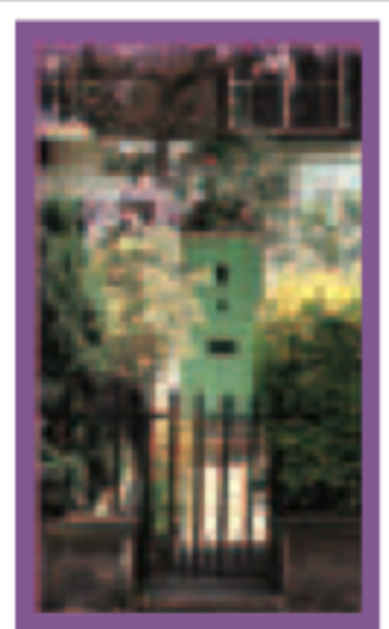
PAGES 214-219 Plans 9-10, 17