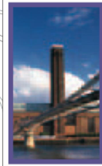
PAGES 172-183 Plans 6, 16