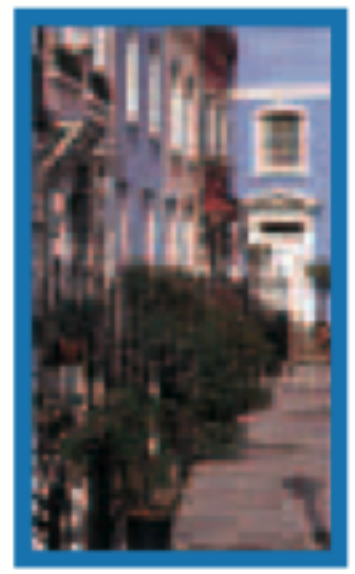
PAGES 192-197 Plans 18-19