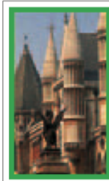
PAGES 132-141 Plans 5-6, 13-14