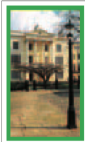
PAGES 220-227 Plans 3-4, 11-12